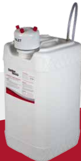
7 Gallon Unit