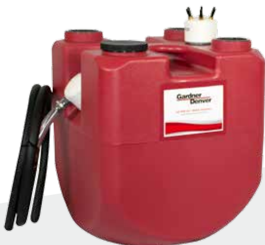
25 Gallon Unit

Instead of opening the unit to replace spent media (a very messy process), when the unit is full, simply dispose of it as non-hazardous waste in accordance with local regulations. If no local disposal is available, ship it back to us and replace it with a new unit. This “fill and replace” method will ensure that both you and your compressor room do not end up covered in air compressor lubricant.