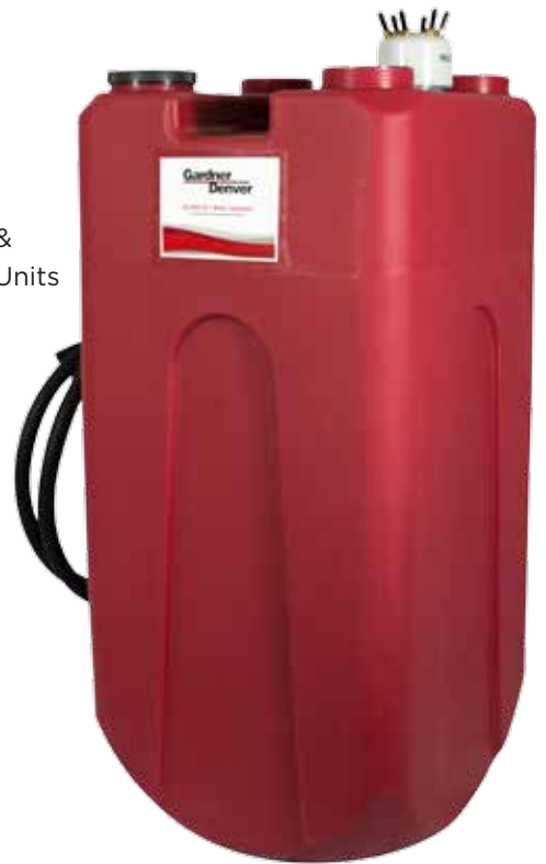
40 Gallon & 60 Gallon Units